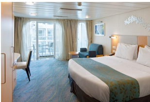
Central Park Balcony