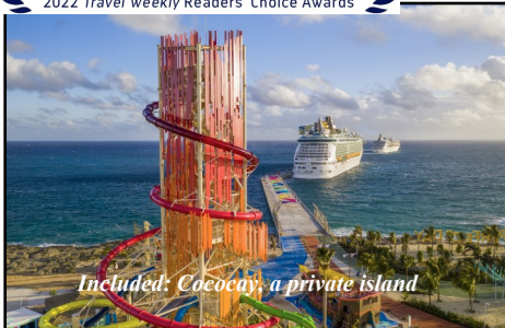
Included: Cococay, a private island

Daily 12 Step Meetings, Keynote Speakers & Parties!