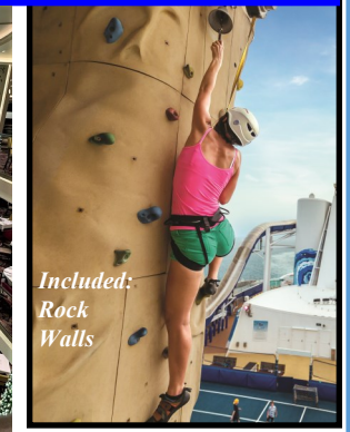
Included: Rock Walls