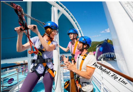
Included: Zip Line