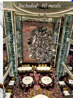
Included: All meals