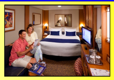
Interior Stateroom, $1,578. per person, double occupancy, Single Occupancy $3,156.

Deposit $330.00 per person. Double occupancy, $580. single occupancy. This will be deducted from your total trip at time of booking.