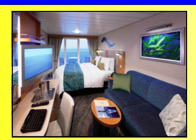
Balcony Stateroom $2,317. per person double occupancy. Single occupancy $4,634.