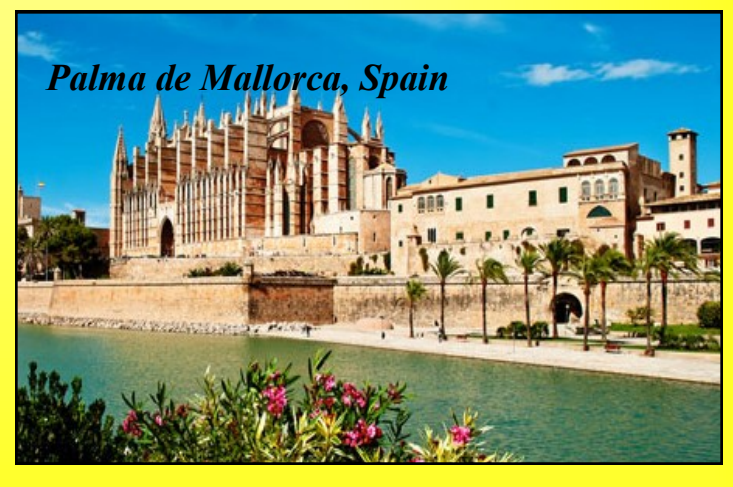
www.sobercelebrations.com, taking thousands on fellowship vacations since 2001