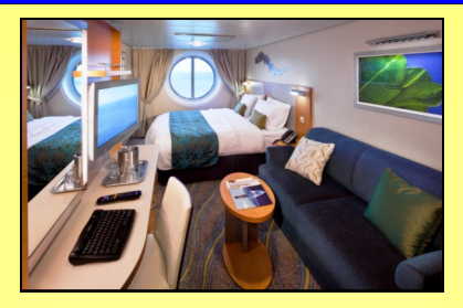
Oceanview Stateroom, $1,814. Per person, double occupancy, Single Occupancy $3,628.