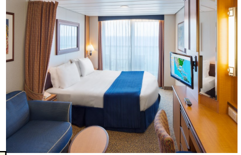
Photos show 1 bed. All rooms can be 2 beds also Oceanview Balcony: 179 sq. ft., 41 sq. ft. Balcony CALL FOR TODAY'S RATE 561-702-2312

Deposit: Double Occupancy: $300. per person, Single Occupancy, $600.