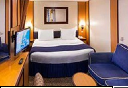
Photos show 1 bed. All rooms can be 2 beds. Interior Cabin: 165. sq. ft. STARTS at $1,188. per person Double Occupancy., $2,276. Single Occ.

TRIPLE, QUAD, & SUITES upon request, with non refundable deposits. The rates below are refundable until final payment February 24, 2025.