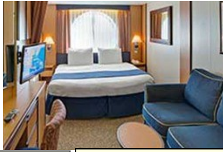
Oceanview #1. STARTS at $1,531. per person, double occupancy, Single: $2,962.